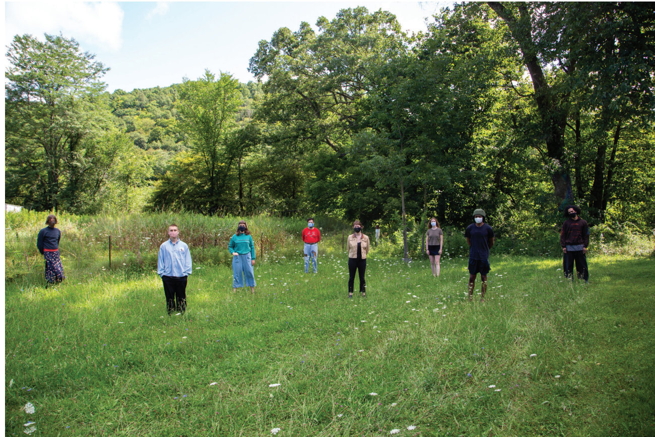
Our guests Anna's pose for a group photo at the end of a 4 day retreat.

“The space ACRE created this summer epitomizes their dedication to caring for and fostering spaces of community building. Everyone in the Anna’s cohort felt restored and hopeful.”