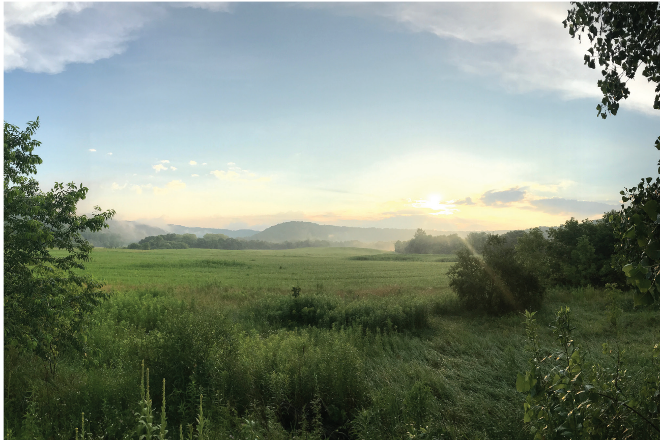
A view from the ACRE kitchen.