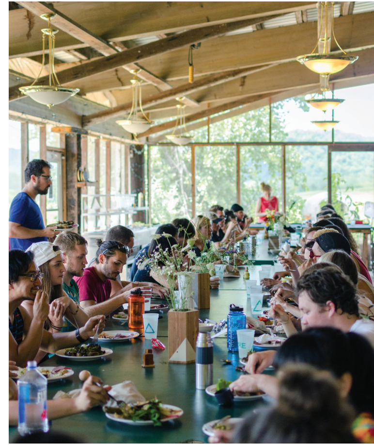
Lunch Session 2, 2017.

ACRE Kitchen serves three thoughtful and nourishing meals per day to 60+ residents, staff, and visiting artists at the residency.