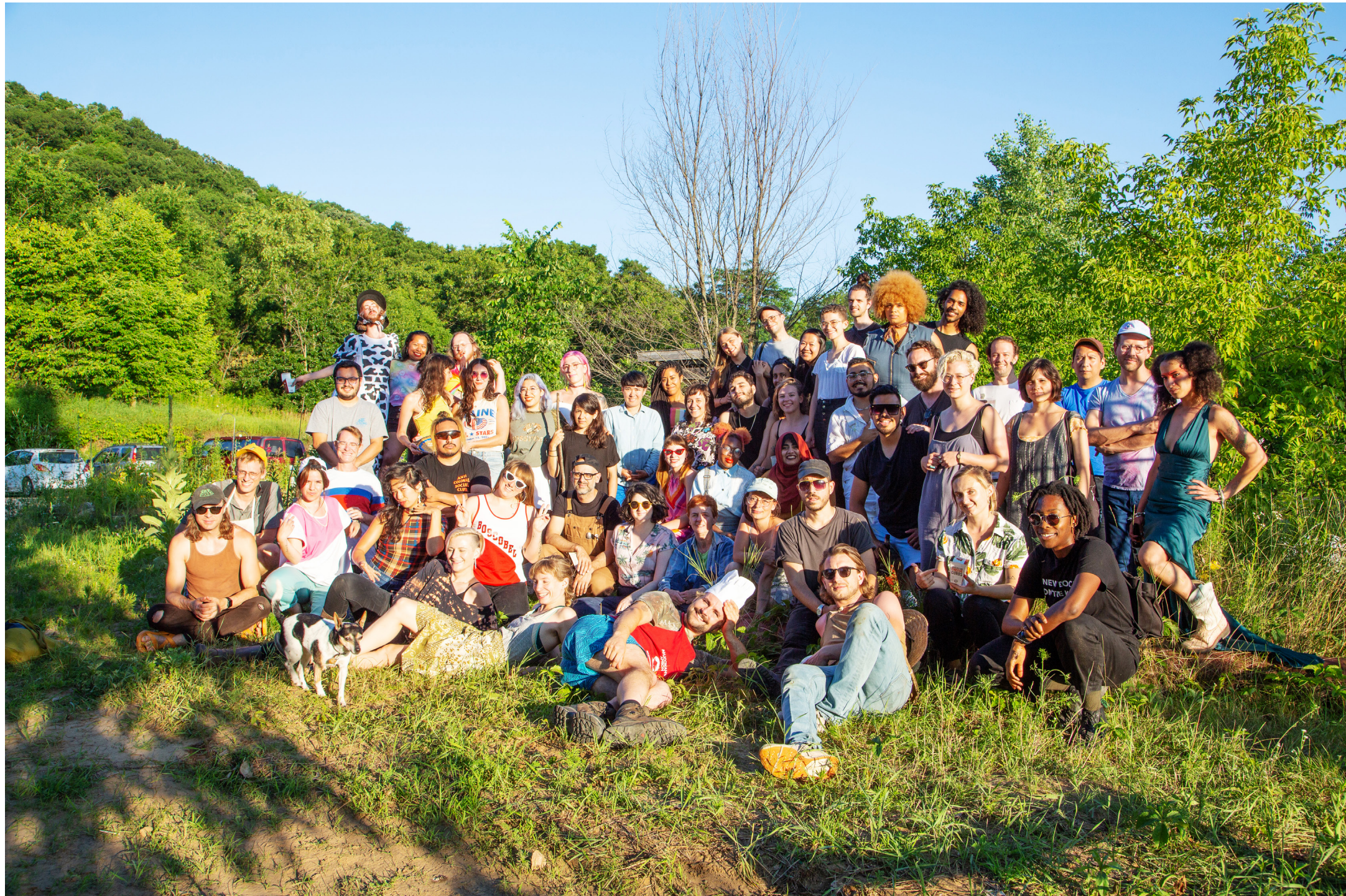
Session 1, 2019