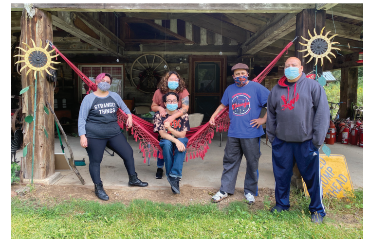
Top: The Atmo reading group poses for a screenshot after our first session this summer. Atmo #3 begins November 25. Bottom: Leadership of the Pilsen Alliance pose for a photo after a visit to the farm in September.

ACRE will be adapting its Residency Program to weather uncertain circumstances and enable the organization to safely host residents. This includes expanded session options and more focused programming. By monitoring our occupancy, practicing social distancing and enhanced cleaning procedures, and working with our incoming residents we will shape a safe and healthy environment together.