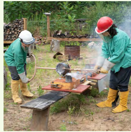
HIGH FIRE (Foundry)